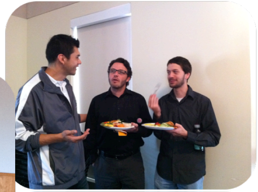
UCSB Graduate students discuss Catholic mystical spirituality over lunch.