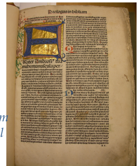
Exhibit of Medieval and Early Modern Bibles

Illuminated manuscript from UCSB's Special Collections